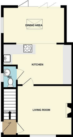
GROUND FLOOR 447 sq.ft. (41.5 sq.m.) approx.